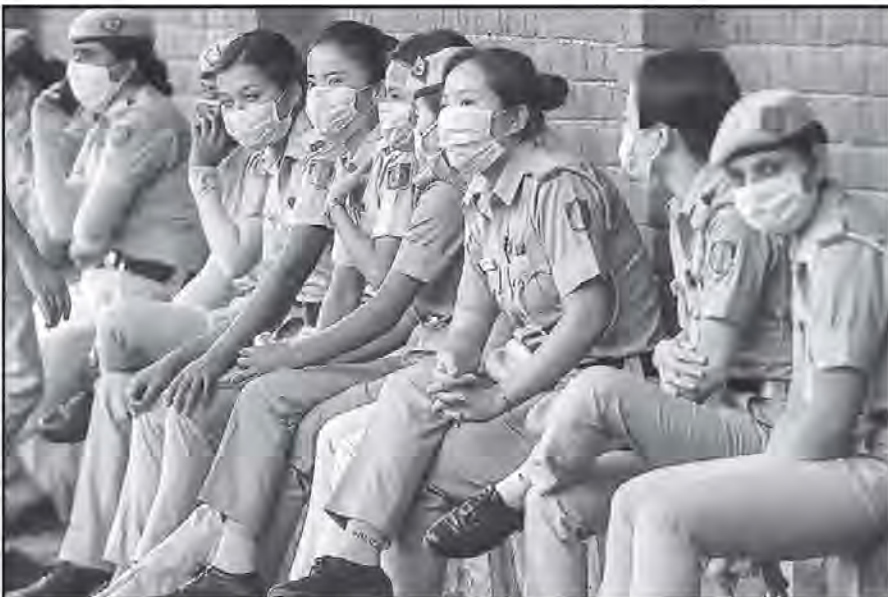
નવી દિલ્હીમાં ડુટા (દિલ્હી યુનિવર્સિટી ટીચર્સ એસોસિએશન)ના સભ્ય અધ્યાપકો દ્વારા તેમની માંગણીઓને લઈને સરકારના વિરોધમાં યોજાયેલા દેખાવો દરમિયાન માસ્ક પહેરીને તૈનાત મહિલા પોલીસ સ્થિતિ પર ચાંપતી નજર રાખીને બેઠેલી નજરે પડે છે.

પ્રત્યક્ષ વિદેશી રોકાણના નિયમો હળવા કરતાં વિદેશી કંપનીઓ સંરક્ષણ સાહસોમાં ડાહજ સુધી હિસ્સો ખરીદી શકે છે. ભારત તરફથી પૂરતો ઓર્ડર મળે તો નવી પ્રોડક્શન લાઈન ઉભી કરવા ફાંસને રસ છે. ભારતે તૈયાર ૩૬ રાફેલ વિમાનોની ખરીદી માટે ઓર્ડર આપ્યો છે, પણ ૧૦૮થી વધુ વિમાનોની ખરીદીની ખાતરી આપવામાં આવે તો જ એ ફાંસને ગ્રાઈ બનાવવાનું આર્થિક રીતે ધરવડી શકે. સૂત્રોના જણાવ્યા મુજબ ૩૬ વિમાનોની પ્રથમ બેચ માટે ચૂકવેલા ૭.૮ અબજ પુરો કરના વધારાના ઓર્ડરની કિંમત ઘણી ખોટી હશે.